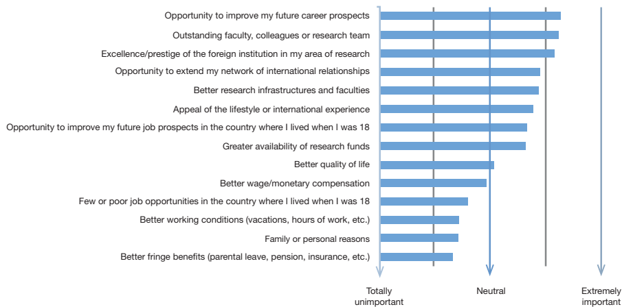
Figure 1 Factors influencing emigration for postdoc, employment or academic job. Answers to the question, “How important was each of the following factors behind your choice to take a postdoc, employment or academic job in a country different from the one where you lived when you were 18?” ranked by order of importance.

who lived in a core country at age 18. Because response rates varied by country, probability weights have been used to compute the reported rates.